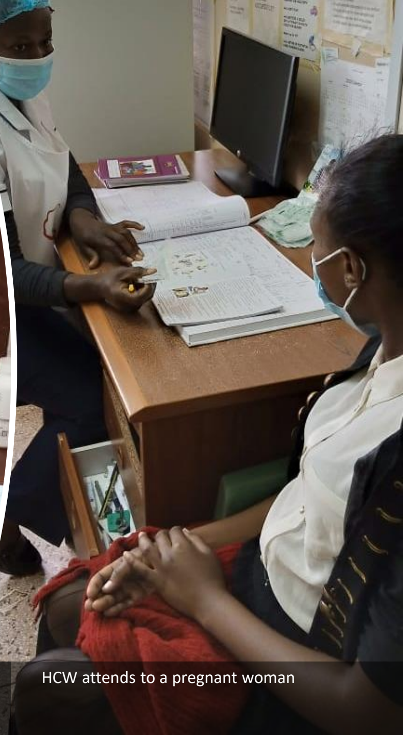
HCW attends to a pregnant woman