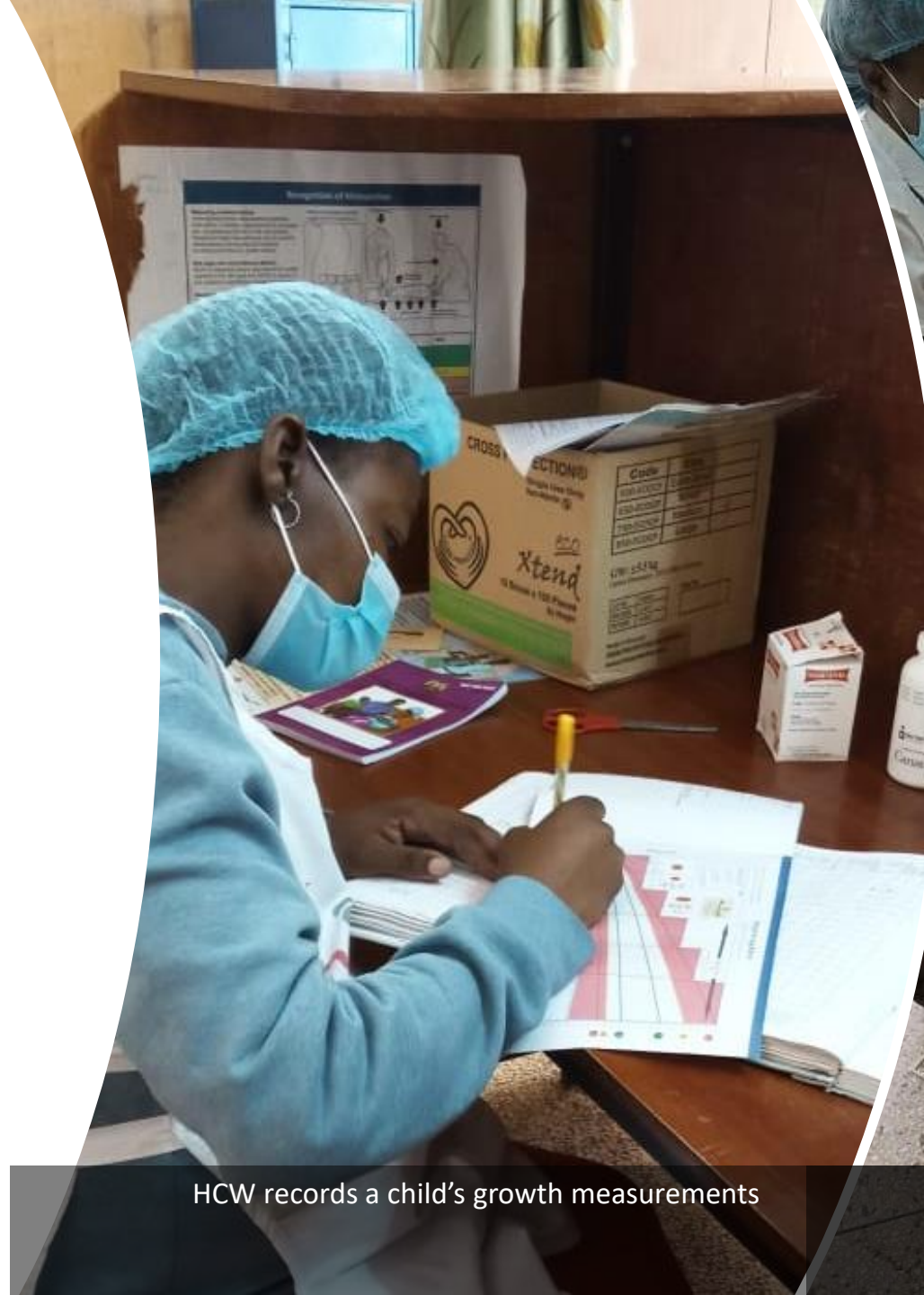
HCW records a child's growth measurements